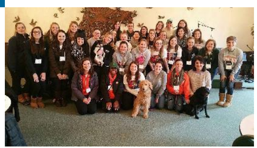
Did you get a thank you call from BGSU?

To reduce the overpopulation and suffering of dogs and cats through education and low-cost spay/neuter programs and to rescue, vet and place adoptable dogs and cats into good permanent homes.