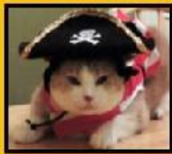
Smudge, 2014 Halloween Photo Contest Winner